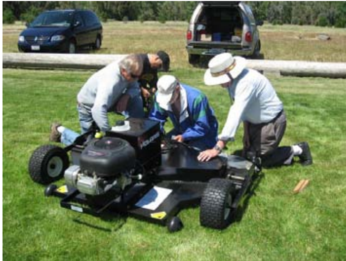
The assembly crew

launch areas take about an hour and a half each to mow. This mower when pulled behind the tractor mower can cut about a 9 or 10 foot wide swath. This was a great investment for the club. Come on out and ask me for a quick lesson on how to operate it and spend 15 or 20 minutes mowing, the help will be appreciated by the others that volunteer their time mowing.